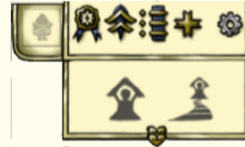
Main HUD (Minimalist style)